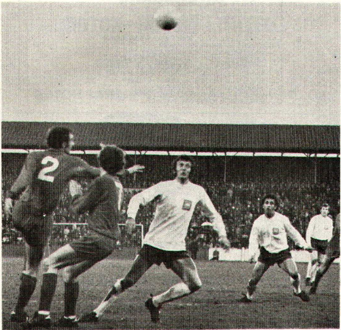
An exciting incident during North End's match with Sunderland